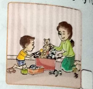
keeping toys in place