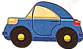
This is a small car